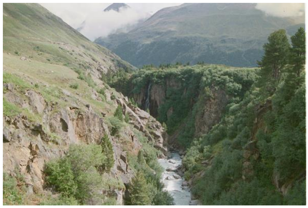
Small, sinuous-straight, highland river with bedrock-coarse mixed sediments in Austria.